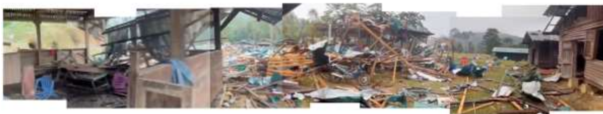
Figure 1: Panoramic view of the destroyed area from Khit Thit Media's video at around 25.836816, 96.364006.

Coordinates of the destroyed area: 25.836816, 96.364006