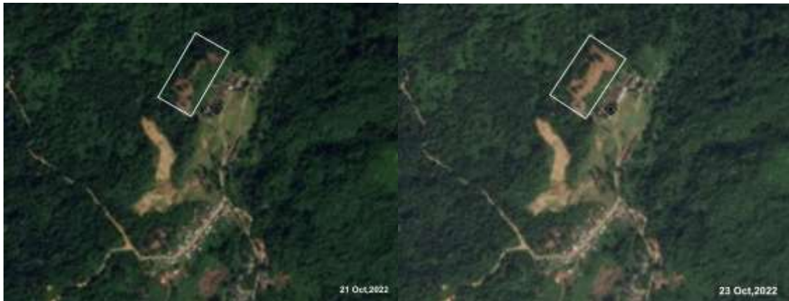
Figure 4: Planet imagery showing a difference in the area between 21-23 October 2022.