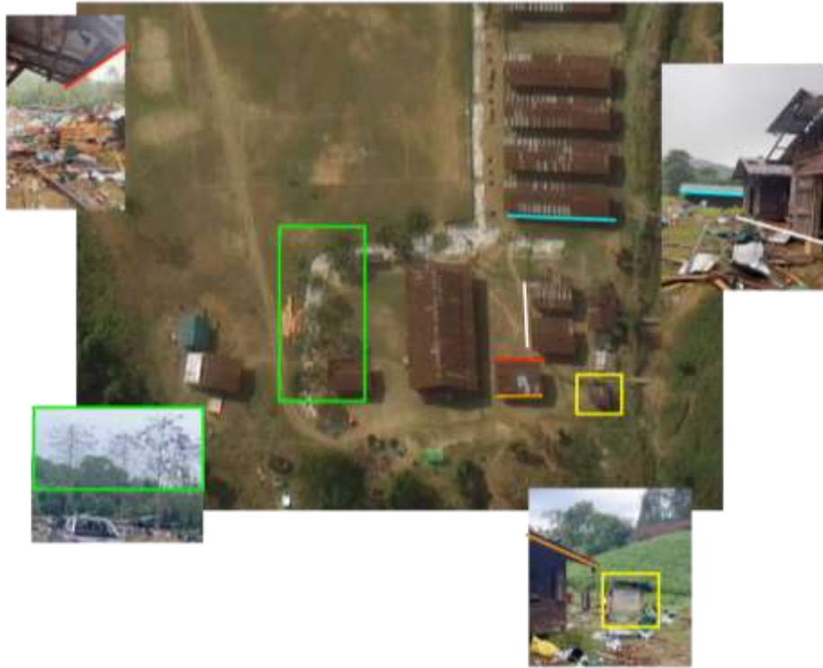
Figure 2: Geolocation details of the event.