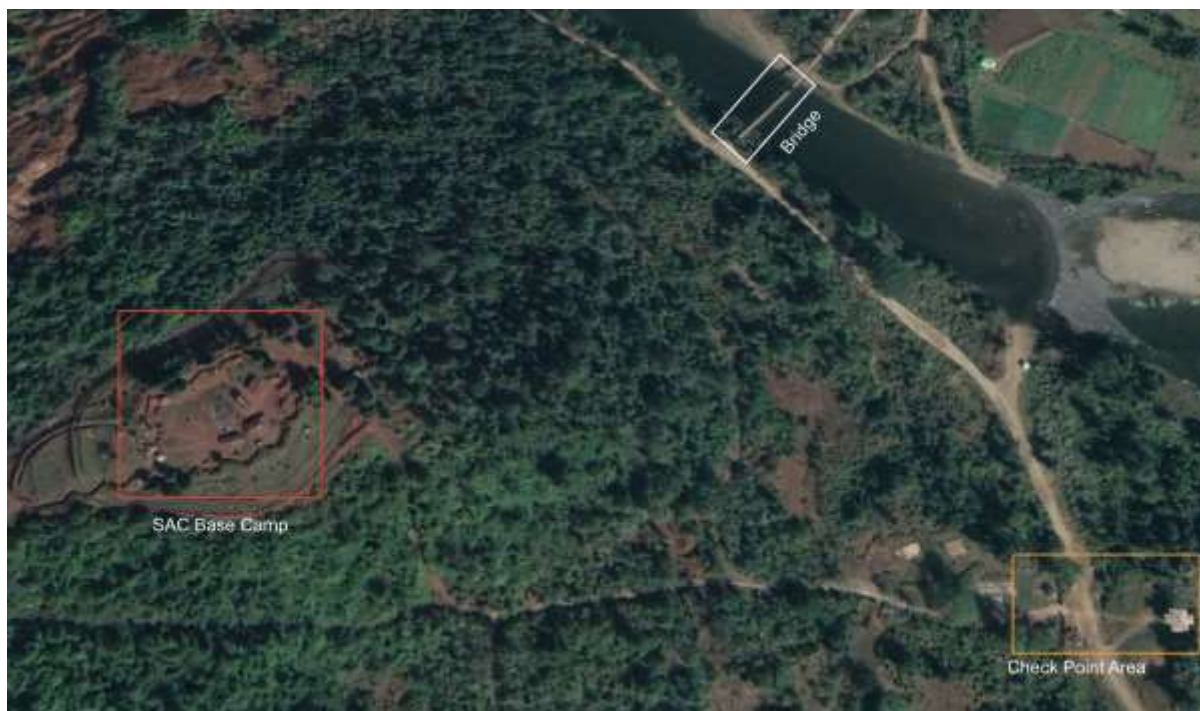
Figure 9: The bridge, highlighted with a white box, which could have been the site of a military roadblock which prevented medical aid from reaching the injured. However, this claim has not been verified. The red box demonstrates the area geolocated by Myanmar Witness.