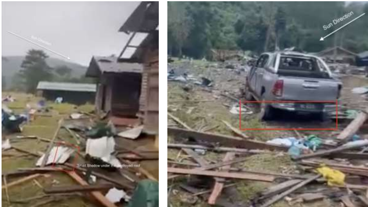
Figure 6: Sun direction labelled and the shadow appearing under the objects highlighted with a red box.