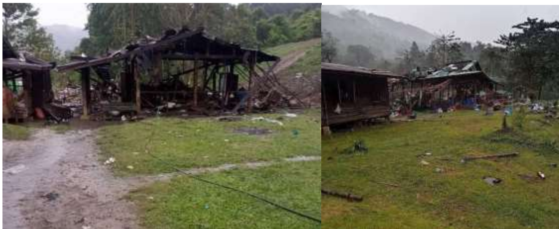
Figure 3: Some structures completely destroyed, located at 25.837176, 96.364021.

Myanmar Witness cross referenced the geolocated area with Planet imagery which shows a clearing being made - possibly in relation to the celebrations - in the area between 21-23 October 2022 (Figure 4). This clearing can be viewed in the footage geolocated to the area. This allows Myanmar Witness to chronolocate the footage; it can't have been taken before 21 October 2022 (Figure 5).