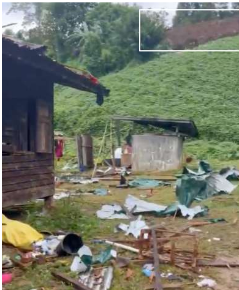
Figure 5: The cleared area of an elevated level of land shown in the footage.