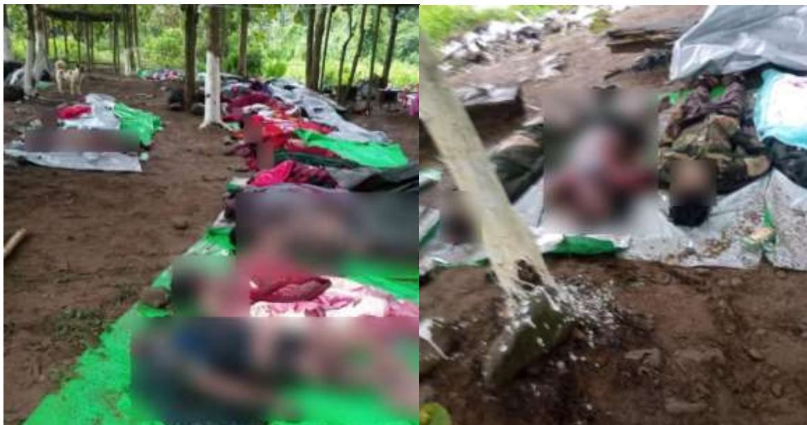
Figure 8: Images show both men and women heavily injured and presumed dead. The right image shows the two individuals in army fatigues. (Source: Manau Voice ).

Myanmar Witness has analysed images that allegedly show dead civilians from this case uploaded by anti-military media outlet Manau Voice . These images show at least 30 corpses - with two in distinctive uniform while the rest appear to be plain-clothed or unknown (Figure 8). However, Myanmar Witness cannot fully verify the number of dead bodies due to a lack of footage and this footage has not yet been geolocated to verify if the images are from this location.