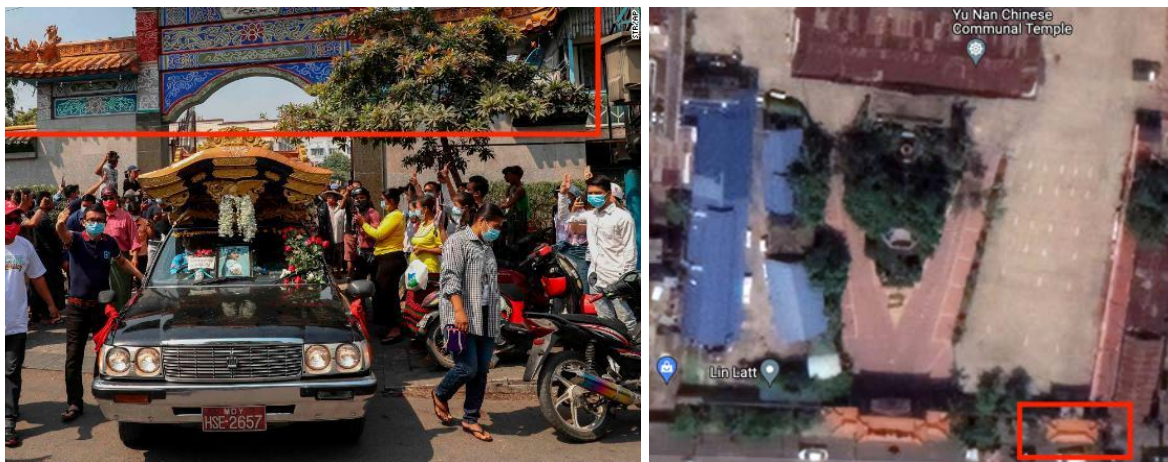
Figure 9: Geolocation of the car departing the memorial service with Angel's body.