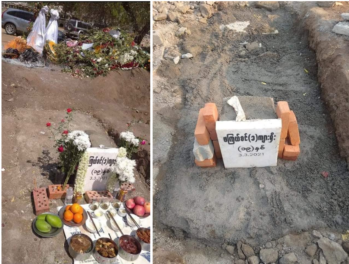
Figure 15: Angel's grave, along with her death date and name.