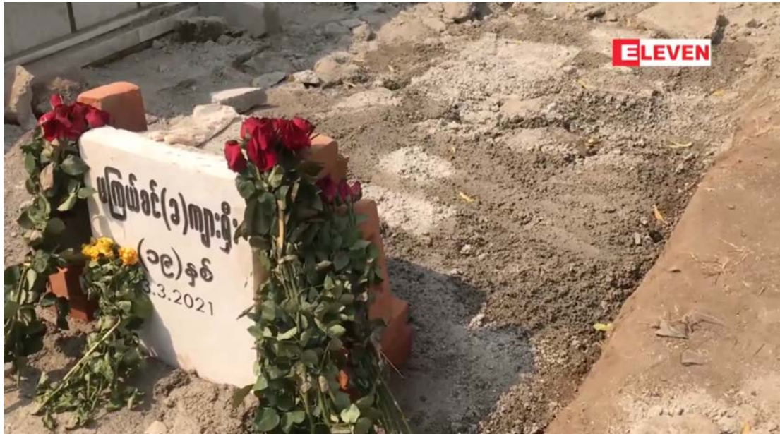
Figure 10: Angel's grave seen covered with cement after being tampered with in the night.

to conduct an autopsy and determine Angel's cause of death. They claim they had gained permission from a judge, but the specifics were not volunteered. According to CNN an eyewitness saw around twenty people with guns enter the graveyard between 1600 and 1900, implying suspicious circumstances and explicitly stating that a military vehicle was present. The person at the gate who let them in was allegedly 'not [to] inform anyone about it' according to CNN's coverage.