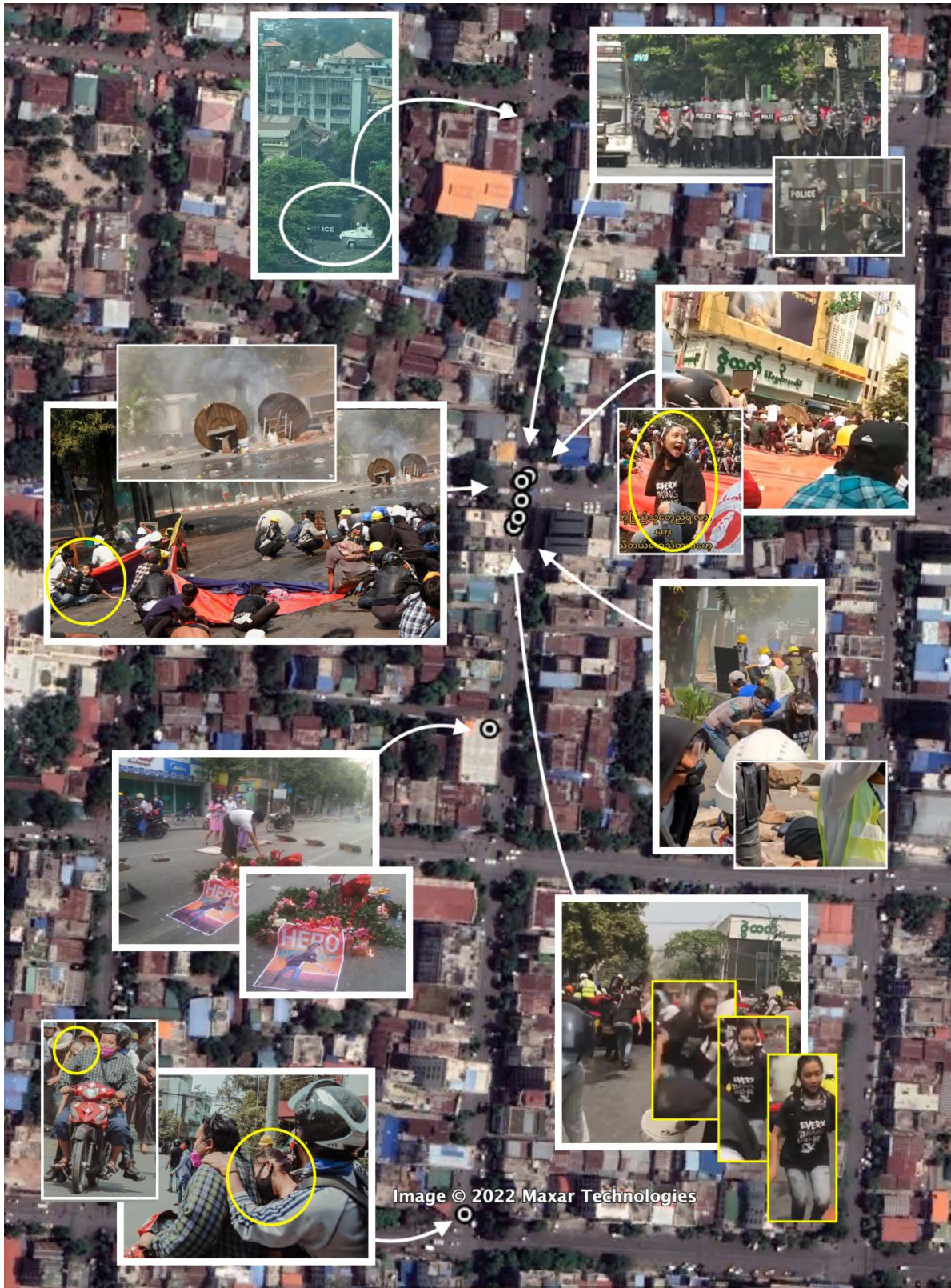
Figure 3: Breakdown of the geolocation of user-generated content concerning Angel.