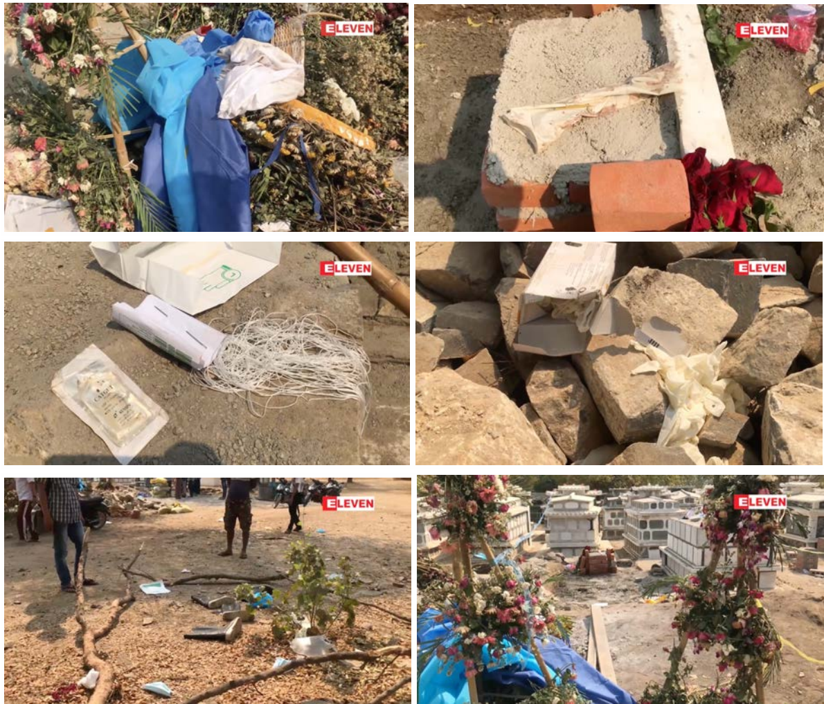
Figure 11: Evidence left after her grave was tampered with, including surgical equipment and gloves.