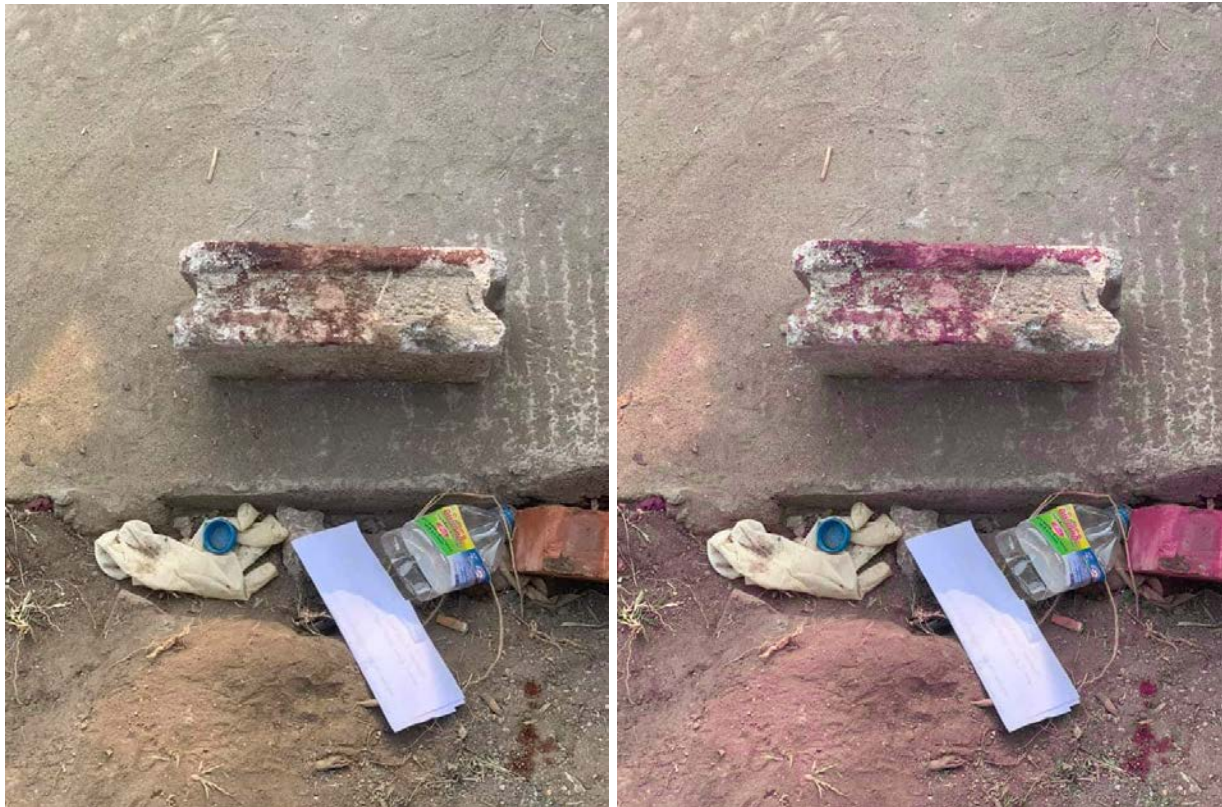
Figure 12: (Left) the original photo; (right) Magenta-optimised photo to highlight blood stains. Brick found next to Angel's grave with bloodstains on it and on the ground. The blood stain pattern is strongest on the long edge and may have been from impact. This suggests that the brick may have been used to crack open her skull. Also note the surgical gloves.

The military announced on Myanmar Radio and Television (MRTV) and Myawaddy News (MWD) that neither they, nor the state police, were responsible for Angel's death. The police also released a statement through GNLM that they had determined that the bullet had not come from a police bullet, saying: "The lead piece found in the head was a type of ammunition that can be fired with a shotgun with 0.38 round of ammunition...", (Figure 13) adding that this ammunition is "different from the riot control bullets used by the Myanmar Police Force". The possibility of Angel's body having been tampered with, potentially using a brick on her head, also coincides with this state narrative focus on bullets used in the shooting, as they would be targeting her head where it might be possible to retrieve a bullet and dismiss the state narrative determining no security force accountability in Angel's death.